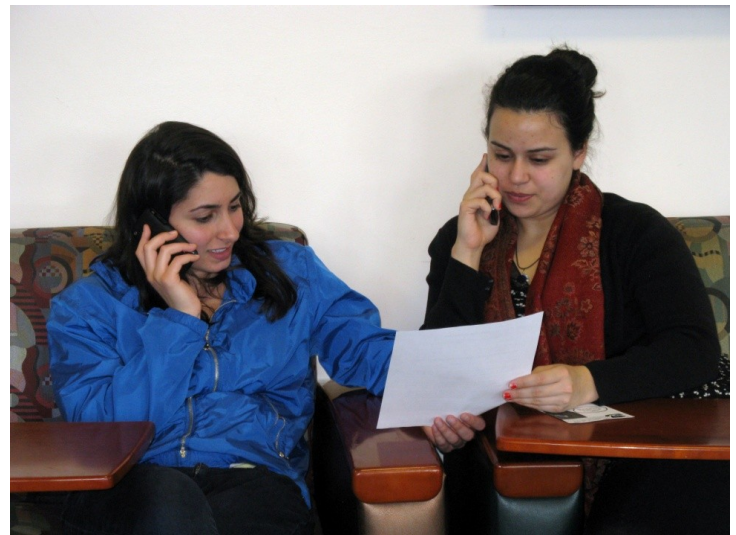
Legislative Call-In Day, April 6, 2011.

PHENOM educates, advocates, organizes, and unites. The question we always face is how much of our resources to put toward campus efforts, and how much to bringing people together in Boston. While it's easier (and may have more impact in the long run) to connect with people on the campuses, our elected and appointed officials are in Boston.