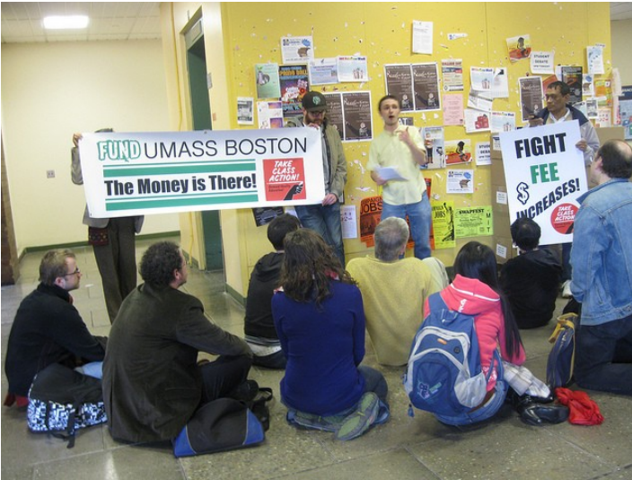
Flash teach-in, April 14, 2011.