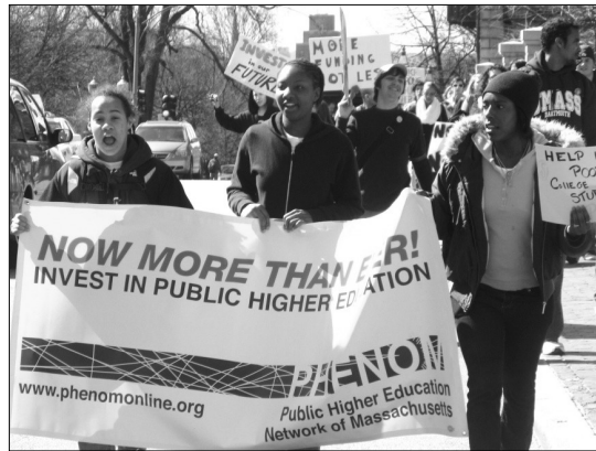
March around the State House, March 8, 2010

times. People elsewhere are waking up to the idea that a robust public sector delivers what we need and cannot buy any other way, like clean air and water, and education from pre-K through college. People increasingly understand that we need fair and reliable taxes to pay for these public