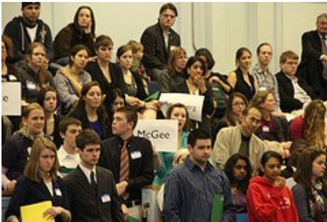
The gallery of Gardner Auditorium at the Massachusetts State House was overflowing on Advocacy Day for Higher Education March 8, 2012.