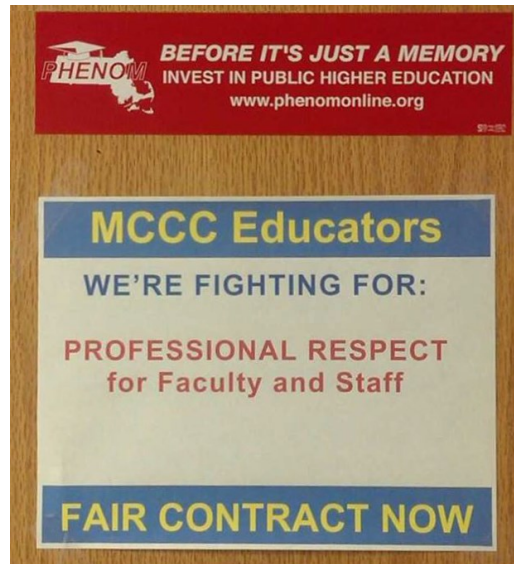
Signs of the times on a faculty office door at Bristol Community College

is “Honor and expand democratic institutions of governance in public higher education.” Strong unions are an essential component of a healthy democratic campus. Proper pay, benefits and working conditions for faculty and staff are critical to providing quality education to students. Working together in PHENOM, thousands of union members and students have come to see that their interests coincide. Good working conditions are indeed good learning conditions. And affordable and accessible campuses allow students to be fully engaged, leading to more satisfying work lives for staff and faculty.