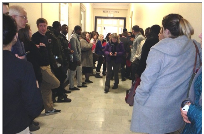
Waiting outside Governor Baker's press conference

PHENOM's work to develop coalitions to send a unified message did not stop after March 4th. The echoes of that message are reverberating, and PHENOM continues to mobilize advocates for the remainder of this year's budget process and for the long haul.